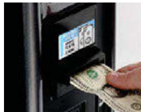
Premium Currency Acceptors Includes standard electronic coin acceptor and $1 & $5 bill acceptor.

Enhances product presentation promoting more sales. No bulb servicing for 5 years. Energy efficient and eco-friendly.