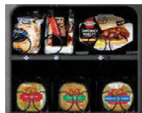
Vends all types of frozen meals, sandwiches & deserts.