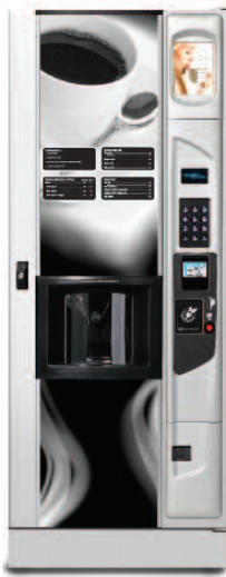
Shown with platinum door and kick panel options.

Available in freeze dried, fresh brew or bean-to-cup configurations, the Geneva dispenses a broad menu of premium and specialty coffees and serves them just the way your customers like them.