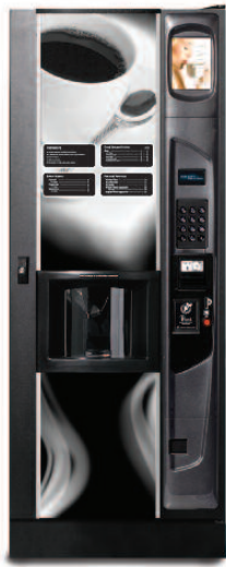
Shown with kick panel option.