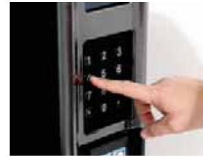
Large and easy to read selection buttons with Braille identification.