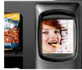
Back lighted point of sale window for advertising and specials.

In order to bring you the best products possible, we continue to improve product design and performance and as such specifications are subject to change without notice. The manufacturer makes no warranties or representations of compliance with any local, state, national or international requirements for the operation of the equipment in any application for which it is capable of being used beyond approvals listed on the product. Any purchaser is required to make an independent analysis of the fitness and legality of the product's usage before it is deployed and must continue to monitor the potential changing nature of compliance requirements. The manufacturer expressly disclaims responsibility for compliance with any laws and affirmatively requires any buyer to make an independent analysis of the fitness and legal basis of any use or application of the subject unit.