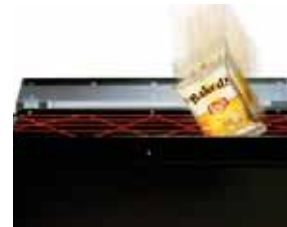
iVend® Guaranteed Delivery System

Keeps customers satisfied and reduces service calls for misloaded product.