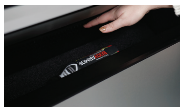
ADA Delivery Bin