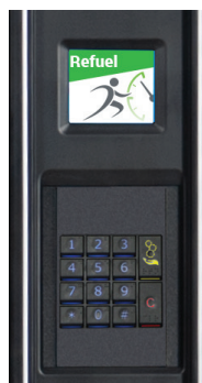
Braille Keypad Standard