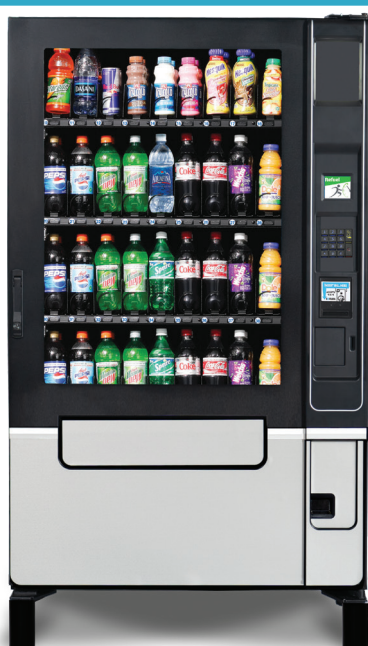
Shown with standard 3.5" Display, Braille Identified Keypad and Leg Covers