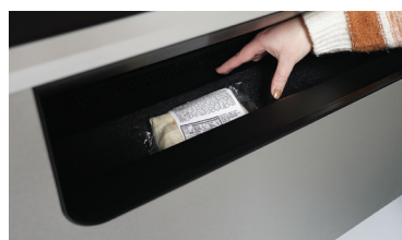
Sell Salads, Sandwiches and more!