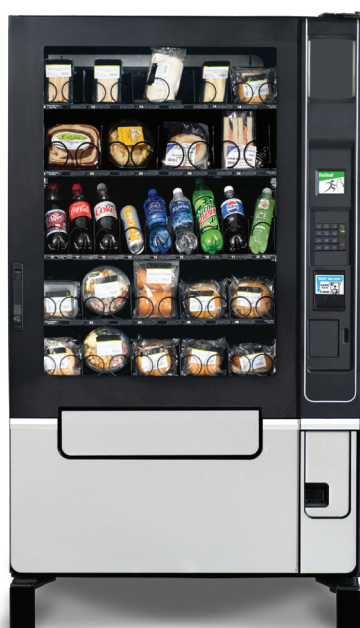
Shown with standard 3.5" Display, Braille Identified Keypad and Leg Covers