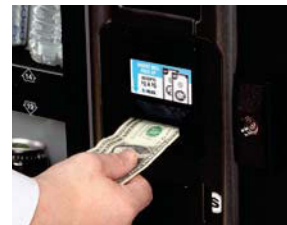
Premium Currency Acceptors Includes standard electronic coin acceptor and $1 & $5 bill acceptor.

With point of sale message and credit display options.