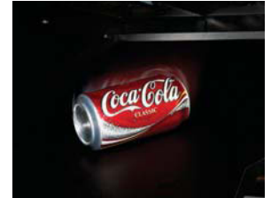
Guaranteed Delivery Sensor System

Keeps customers satisfied and reduces service calls for misloaded product.