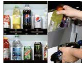
Lighted Live Product Display is easily accessible and allows quick product changes.

Keeps customers satisfied and reduces service calls for misloaded product.