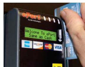
Credit/Debit card reader options.