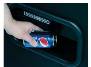
Vends All Popular Brand Beverages