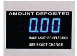
Bright LED Display

With point of sale message and credit display options.