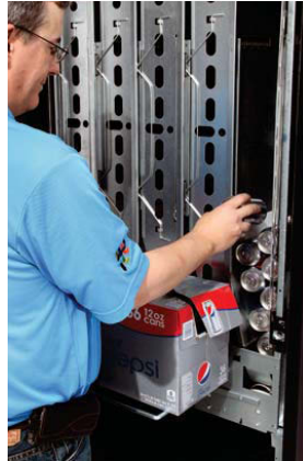
Easy Loading Product Stacks Double deep for high capacity. Built-in case support rack helps speed loading.