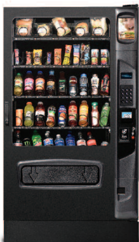
Shown in black with kick panel option.