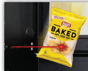
iVend® Guaranteed Delivery System

Keeps customers satisfied and reduces service calls for misloaded product.