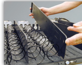
Re-configure trays to almost any package size in the field with no need for tools.