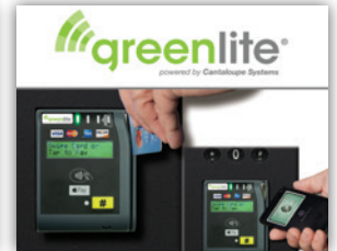
Credit/Debit & mobile reader options.