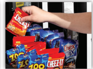
Dispenses All Brand Name Products

Keeps customers satisfied and reduces service calls for misloaded product.