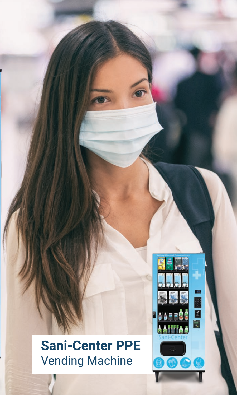
Sani-Center PPE Vending Machine