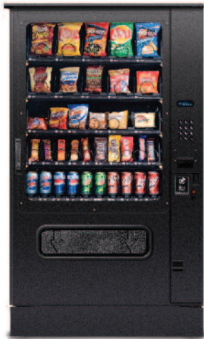
Shown with optional kick panel.