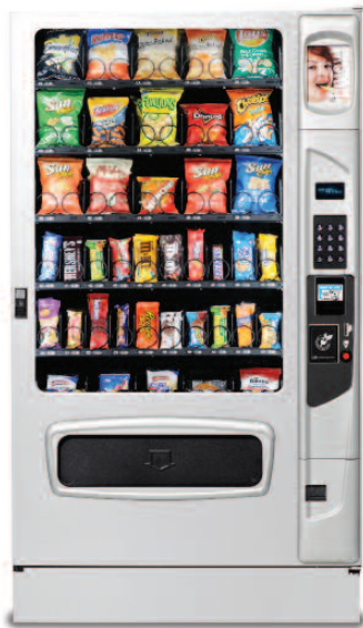
M5000 Shown with Platinum door color & kick panel options.