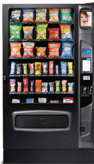
M5000 Shown with iCart touch screen & kick panel options.