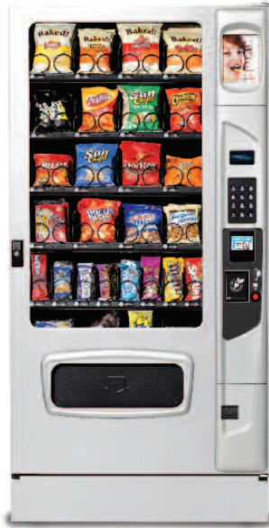
M4000 Shown with platinum door color & kick panel options.