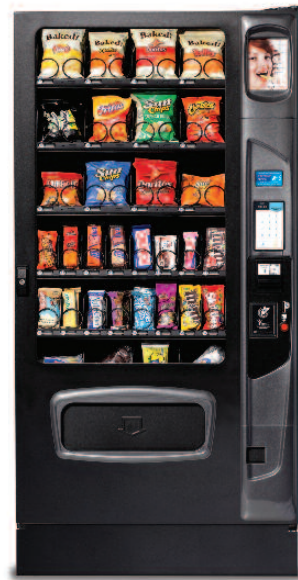
M4000 Shown with iCart touch screen & kick panel options.