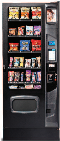
Shown with iCart touch screen & kick panel options.