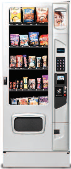
Shown with platinum door color & kick panel options.