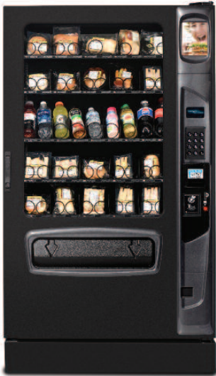
Shown in black with motor pairing and kick panel options.