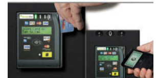
Credit/Debit & mobile reader options.