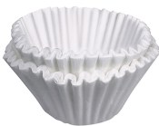
FILTERS.REGULAR1M 500/2 50/CL