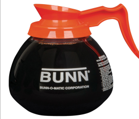
DECANTER, GLASS-ORN 12C 3/CS