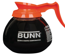
DECANTER, GLASS-ORN 12 CUP 1PK