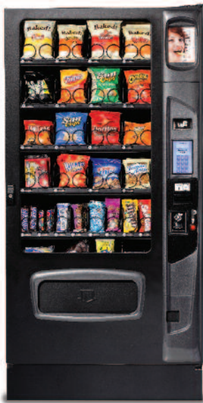
M4000 Shown with ADA door, iCart touch screen & kick panel options.