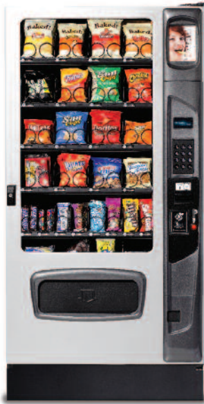
M4000 Shown with ADA door, silver door color & kick panel options.